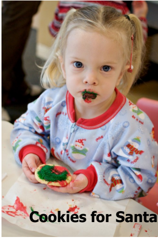
Cookies for Santa

We've had a busy fall, check out what we've been up to!