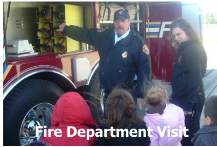
Fire Department Visit