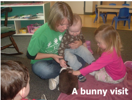
A bunny visit