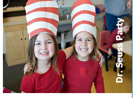
Dr. Seuss Party