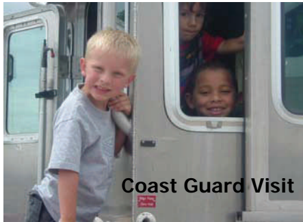
Coast Guard Visit