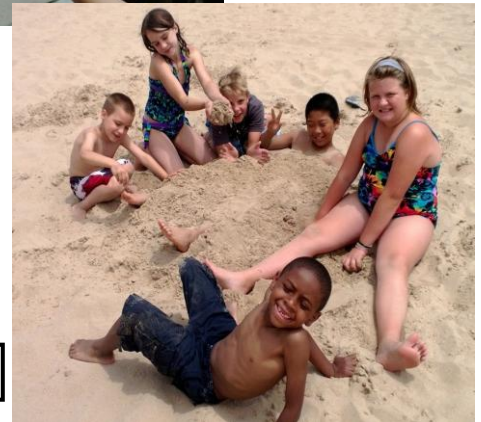
Field trip to the beach